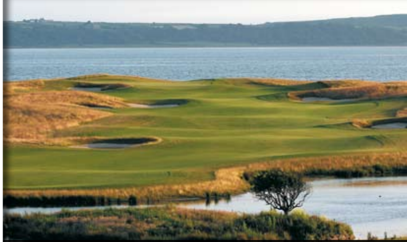
MACHYNYS PENINSULA GOLF & COUNTRY CLUB