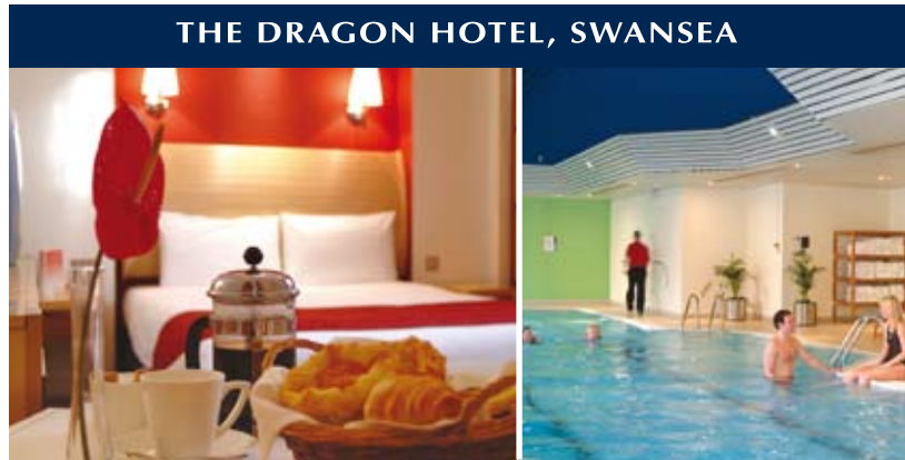
THE DRAGON HOTEL, SWANSEA

The Stradey Park Hotel: Offers a welcome and a quality of the highest order. Spacious rooms, excellent cuisine and a relaxing bar provide the perfect base for your golfing break.