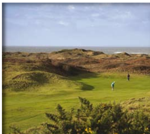
PYLE & KENFIG GOLF CLUB