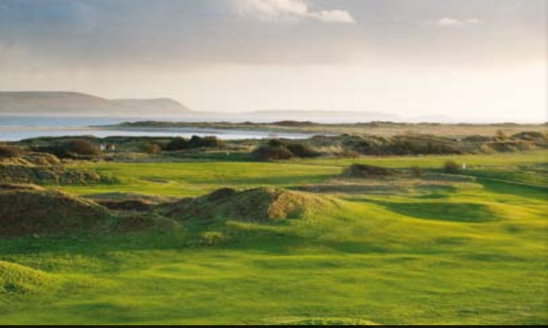
ASHBURNHAM GOLF CLUB