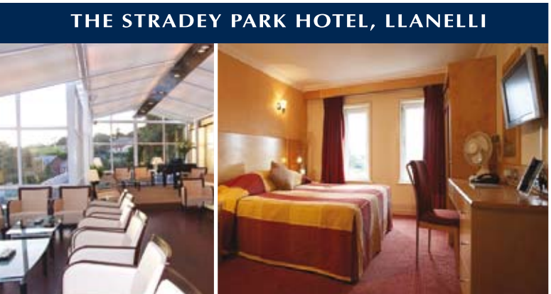
THE STRADEY PARK HOTEL, LLANELLI

The Stradey Park Hotel: Offers a welcome and a quality of the highest order. Spacious rooms, excellent cuisine and a relaxing bar provide the perfect base for your golfing break.