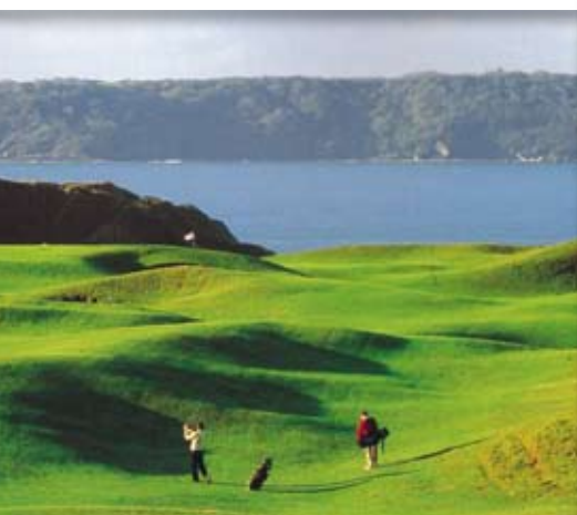
PENNARD GOLF CLUB